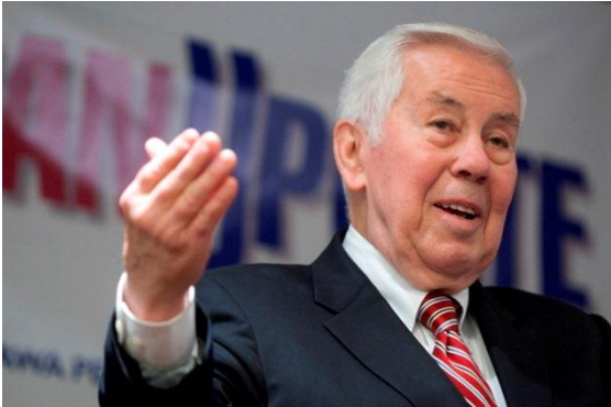
The Honorable Richard Lugar, Former United States Senator

thanks of the Japanese people for Operation Tomodachi, the relief effort launched by the U.S. Government. He also thanked JASI for its remarkable efforts, raising $900,000 in relief and aid donations. Consul General Yoshida noted the special significance of Indiana as one of three cities in the United States chosen to host the Japan Update Conference. In conclusion, Consul General Yoshida emphasized that the Japan-US relationship is indispensable, stressing peace, stability, and the keen desire to develop more opportunities for cooperation.