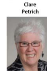
Commissioner Port of Tacoma