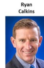
Commissioner Port of Seattle